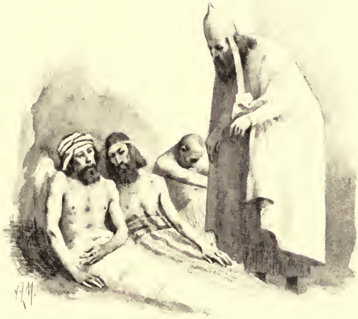
“HE HEALED THE SICK”